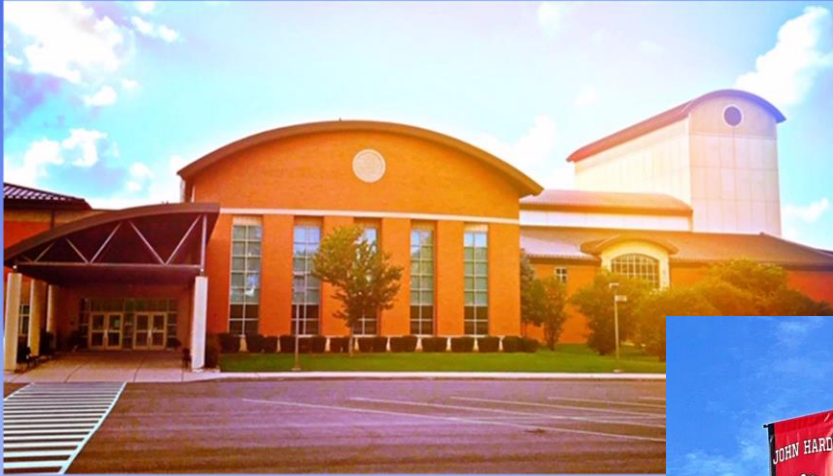
John Hardin High School Bulldogs